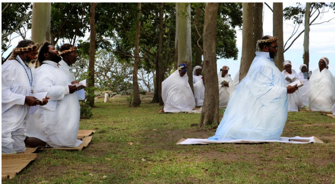
A church service at our neighbouring Shembe church

We have heard stories from other parts of South Africa of revivals within similar churches through discovery bible studies. Perhaps most church denominations need this form of bible and discipleship-based revival. It would be nice to see an indigenous African church that is reflective of African culture thriving and developing passionate followers of Jesus. So, in a sense these conversations evoke something that has been on our hearts for a long time, it reminded us to pray for leaders to rise up to transform the Shembe church and ensure its leading followers to Jesus.